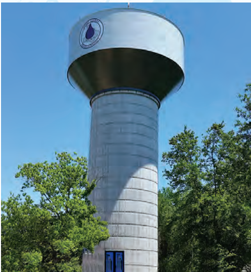
The new HCWA 2 million gallon Ola Water Tank (pictured) and Transmission Main are set to come online in October, to improve service to customers in this portion of the county through more consistent water pressure, while providing more efficient operations of the HCWA water distribution system.

In addition, the Ola Water Tank and Transmission Main, which runs down Highway 81 in McDonough to connect the tank with the Tussahaw Water Treatment Plant, are essential to the Authority's long-range master plan that calls for future expansion of the Tussahaw Plant.