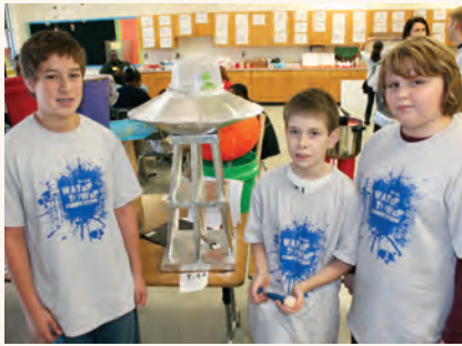
The Georgia Model Water Tower Competition challenges students to create a functioning water tower from household items.

The Georgia Model Water Tower competition is designed to provide