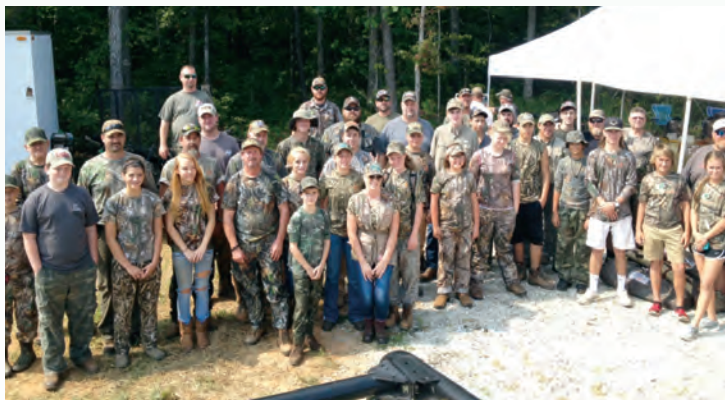
The Henry County Water Authority hosted public hunting on the utility's property for the third consecutive year in 2015, as six events filled shortly after the schedule was announced this summer.

For more information on future hunts at HCWA properties, in addition to other outdoor education and recreation opportunities, customers can contact the Cubihatcha Center at 678-583-3930, log onto our website at www.hcwa.com , or come visit us at 100 Collins Drive in Locust Grove.