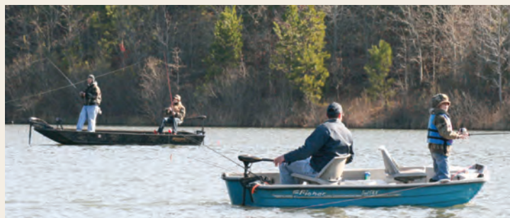
Select reservoirs will remain open for public fishing this winter on a limited basis during the months of December, January and February.

For more information on outdoor recreation at the HCWA, contact the Authority staff at the Cubihatcha Outdoor Education Center at 678-583-3930, or log onto our website at www.hcwa.com .