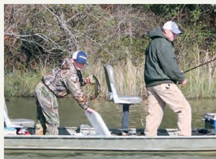
The teams competing in the inaugural Cubihatcha Center Youth Fishing Tournament fundraiser at the HCWA Long Branch/James H. Roland Reservoir faced cold temperatures and difficult conditions. Still, this team found success when reeling in a bass that was among the better catches of the day.

Sponsors of the Youth Fishing Tournament fundraiser included: Henry County Water, Southside Sportsman Association, Maurice Sporting Goods, and JWA Public Communications.